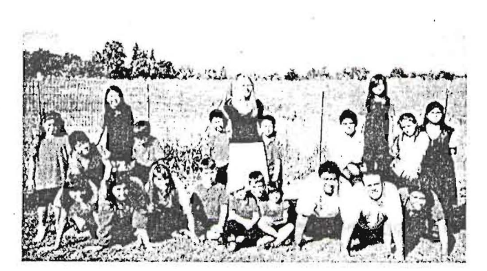
Small Cloud Christian School - September, 2002

Small Cloud exists because of faith in the promises of God. It is easy to read about faith in the Bible. The life histories of Noah, Abraham, Moses, and many other mighty men of faith have been recorded for our learning and encouragement. But we do not receive faith by osmosis. Each of us