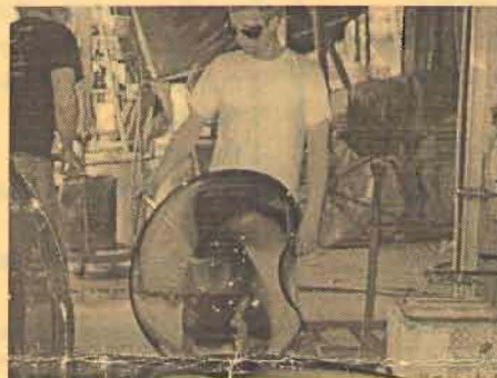
The finished project being shown prior to placing it in a kiln to cool down