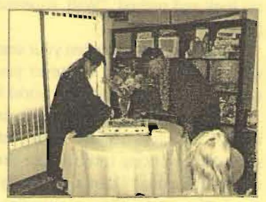
Cutting the graduation cake