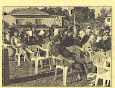
Family and friends