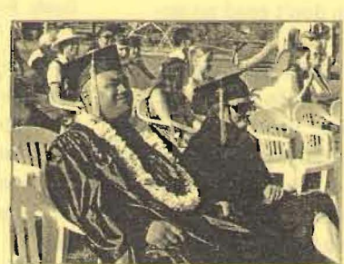
Awaiting the diplomas