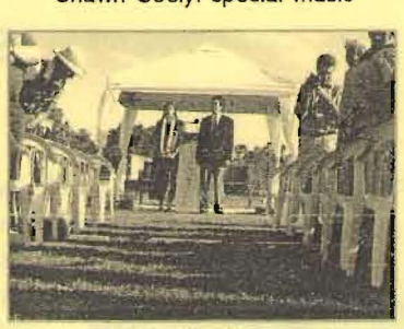
Awaiting the graduates