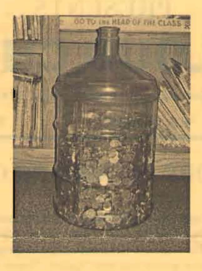
A JUGFUL OF COINS!

Small Cloud students recently engaged in a very exciting project. A kind, generous donor had given Small Cloud a five-gallon jug full of coins, asking that the students count out the money. What a wonderful, hands-on math project! According to Megan Petrovich (age 4), "Counting money is good exercise for our fingers!"